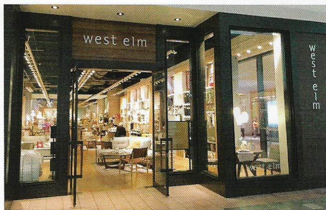
West Elm at Plaza las Americas offers a selection of modern furniture, home accessories and kitchen items.

Upstairs on the indoor/outdoor third level, shoppers can rest in comfortable chairs and couches, dine at eateries like Burger & Beer Joint and Prosecco Bar, and peruse an Italian market with a Puerto Rican spin.