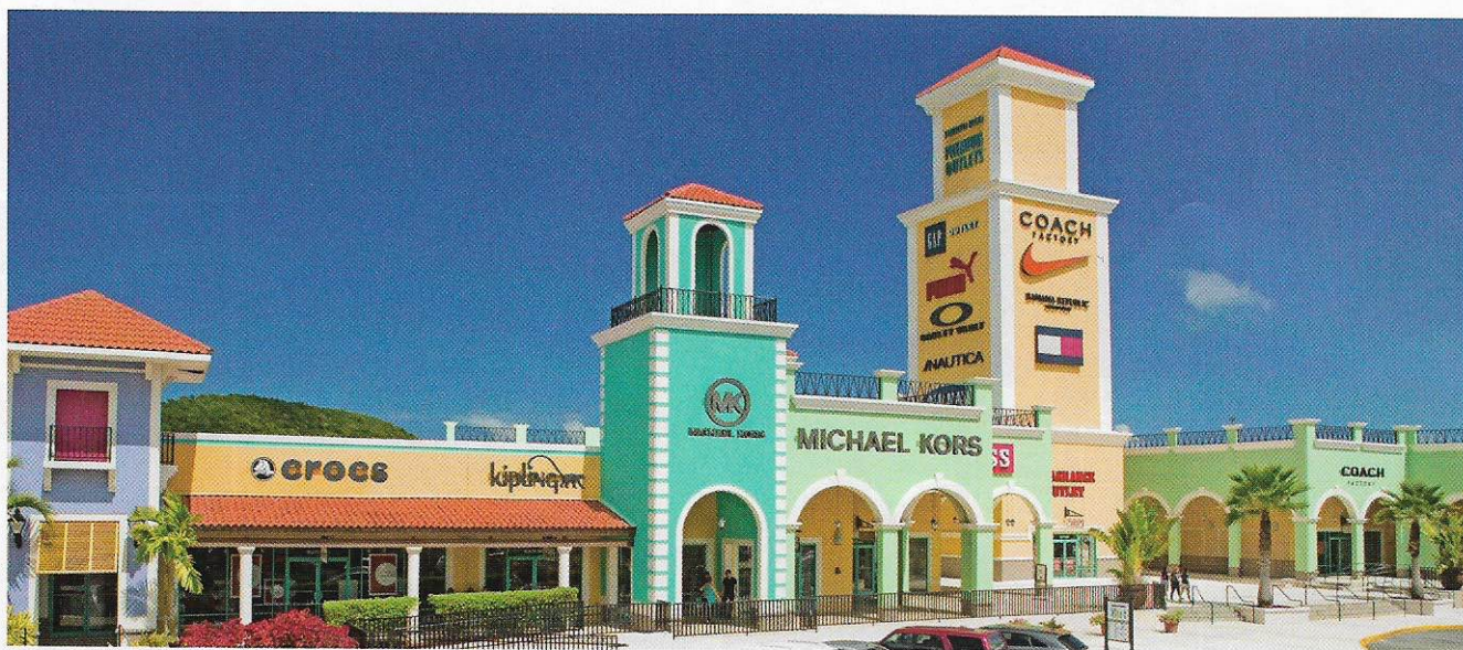
Puerto Rico Premium Outlets in Barceloneta is perfect for bargain hunting and hassle-free shopping.

most with food court selections, movie theaters and mega stores.