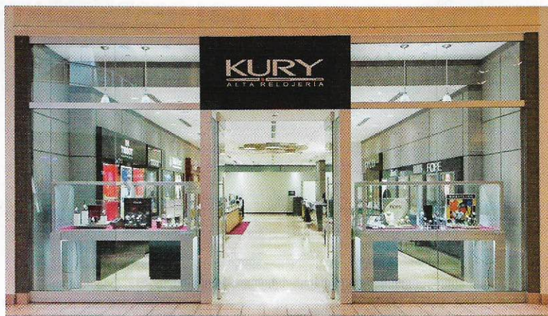
Find the most upscale timepieces at KURY Alta Relojeria in Plaza las Americas.

centers like Plaza Carolina in Carolina; Plaza del Caribe in Ponce; and the Mayaguez Mall, the third largest shopping center in Puerto Rico with a total of 1,050,000 square feet of retail space, and it is the main shopping center in western Puerto Rico. The island is also full of small strip malls found almost at every corner