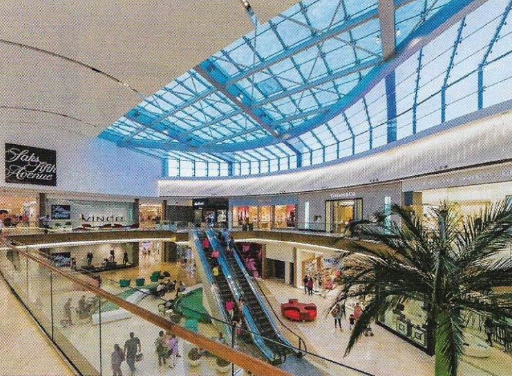
The Mall of San Juan is a luxury shopping oasis anchored by Nordstrom and Saks Fifth Avenue.

When hunger sets in, grab a bite at eateries like Starbucks or The Cheesecake Factory, then end the day with a Hollywood blockbuster at the mall's thirteen-screen movie theater.