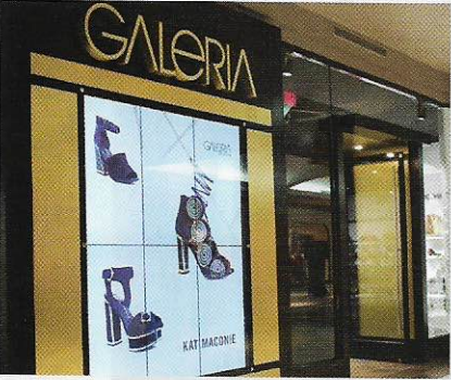
Galeria provides a variety of shoes, bags and accessories.