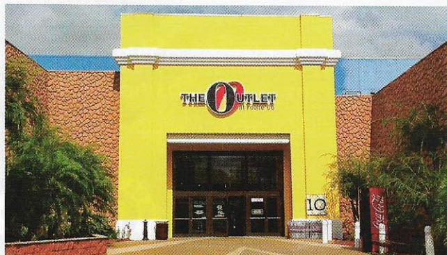
The Outlet at Route 66 in Canovanas has 77 shops offering customers a broad range of options.

So go ahead, splurge on a designer outfit, nab a one-of-a-kind souvenir, score a deep discount or pick up a few creature comforts. If you go overboard, don't worry; you can always buy (and fill!) another suitcase to bring your haul home. ☑