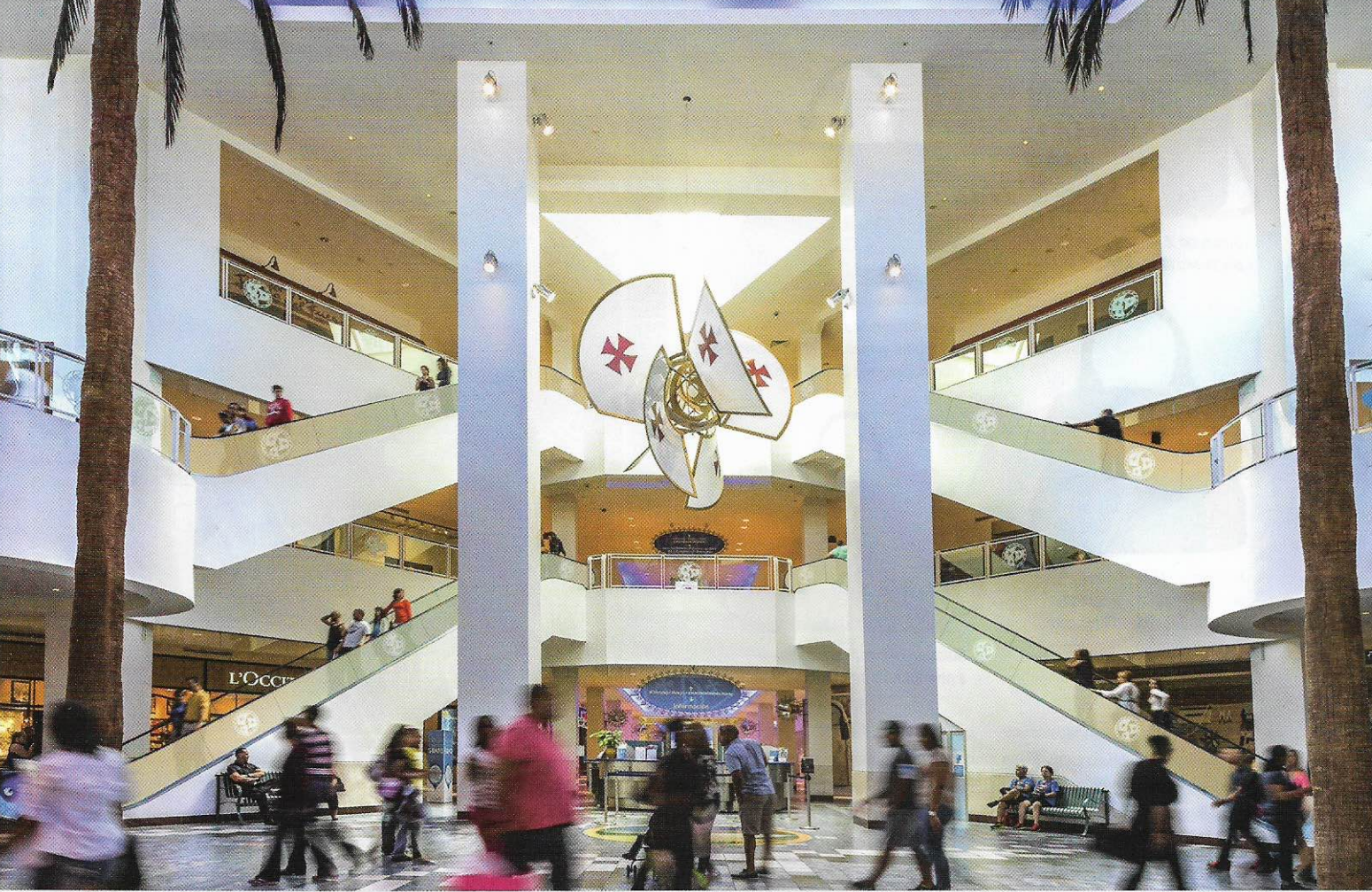
Plaza las Americas is the Caribbean's most-visited retail entertainment destination with more than 300 shops.