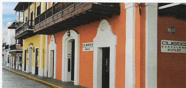
Old San Juan offers a distinctly Puerto Rican experience.

Here, big spenders frequent upscale stores looking for harder-to-find clothing and accessories like Nativa Boutique, Suola, ABITTO,