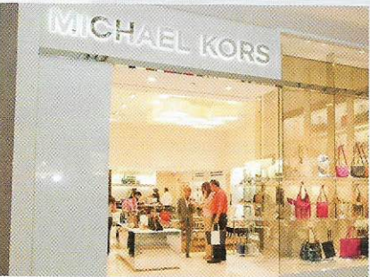
Michael Kors at Plaza las Americas offers classic clothing, handbags and accessories.

Victoria's Secret cater to adults, kids love stepping into the Disney Store and Build-A-Bear workshop. Kury Jewelers at Plaza las Americas is 'the place to shop' for an exquisite selection of modern and innovative trinkets for women and men alike that includes necklaces, bracelets, rings, pendants, watches, earrings and purses from all of your favorite designers like Pandora, Alex and Ani, Pesavento, Folli Follie, Endless, Double Bone, among others. This striking store celebrates plenty of special activities and promotions year round in their facilities that also include Plaza Caribe in Ponce.