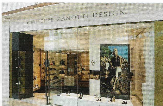
Giuseppe Zanotti opens its first boutique shop in Puerto Rico at The Mall of San Juan.