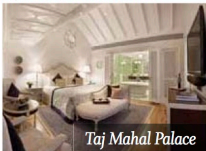
Taj Mahal Palace

Falaknuma Palace sits amongst the clouds, 2,000 feet above the city. At this "mirror in the sky," a personal butler is on hand for each guest staying in one of the 60 rooms.