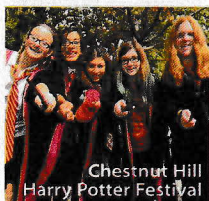
Chestnut Hill Harry Potter Festival