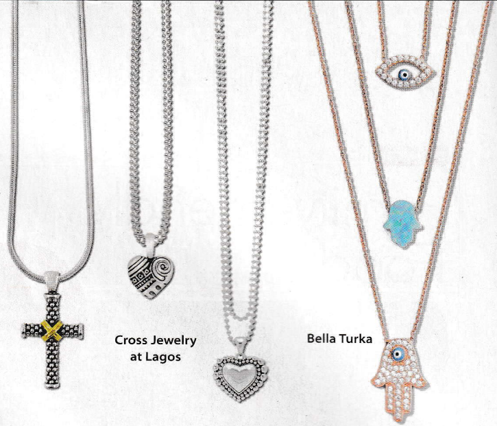
Cross Jewelry at Lagos

(LEFT) ©COURTESY THE FRANKLIN INSTITUTE; (CLOCKWISE FROM TOP LEFT) ©COURTESY BELLA TURKA; ©LAGOS; ©COURTESY NMAJH; ©LIGHTFORMER